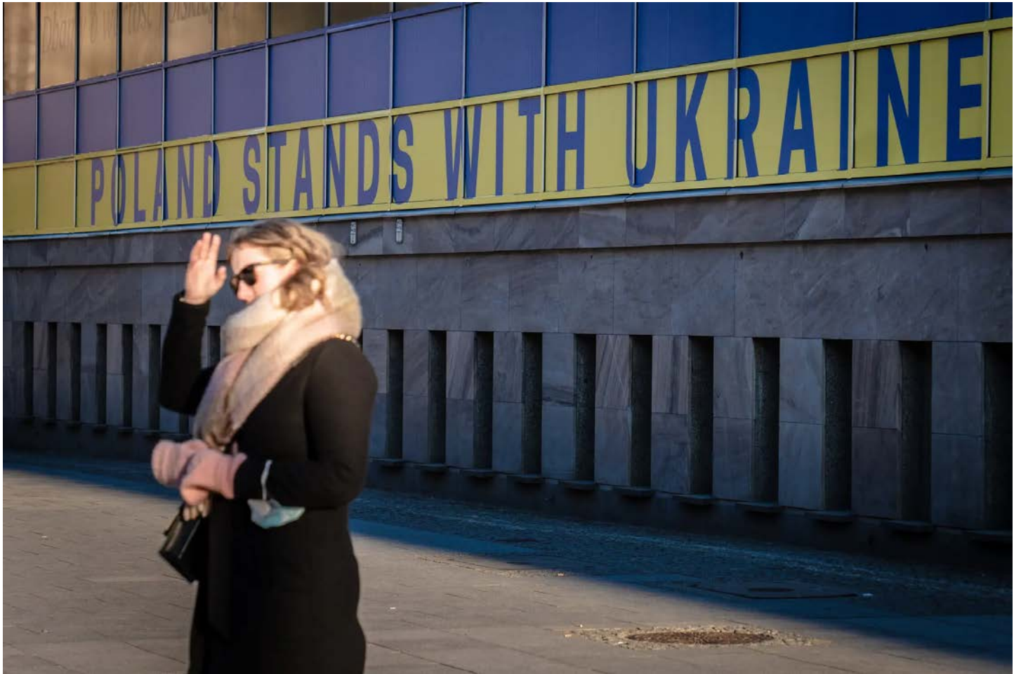
A sign showing Polish solidarity with Ukraine in Warsaw.