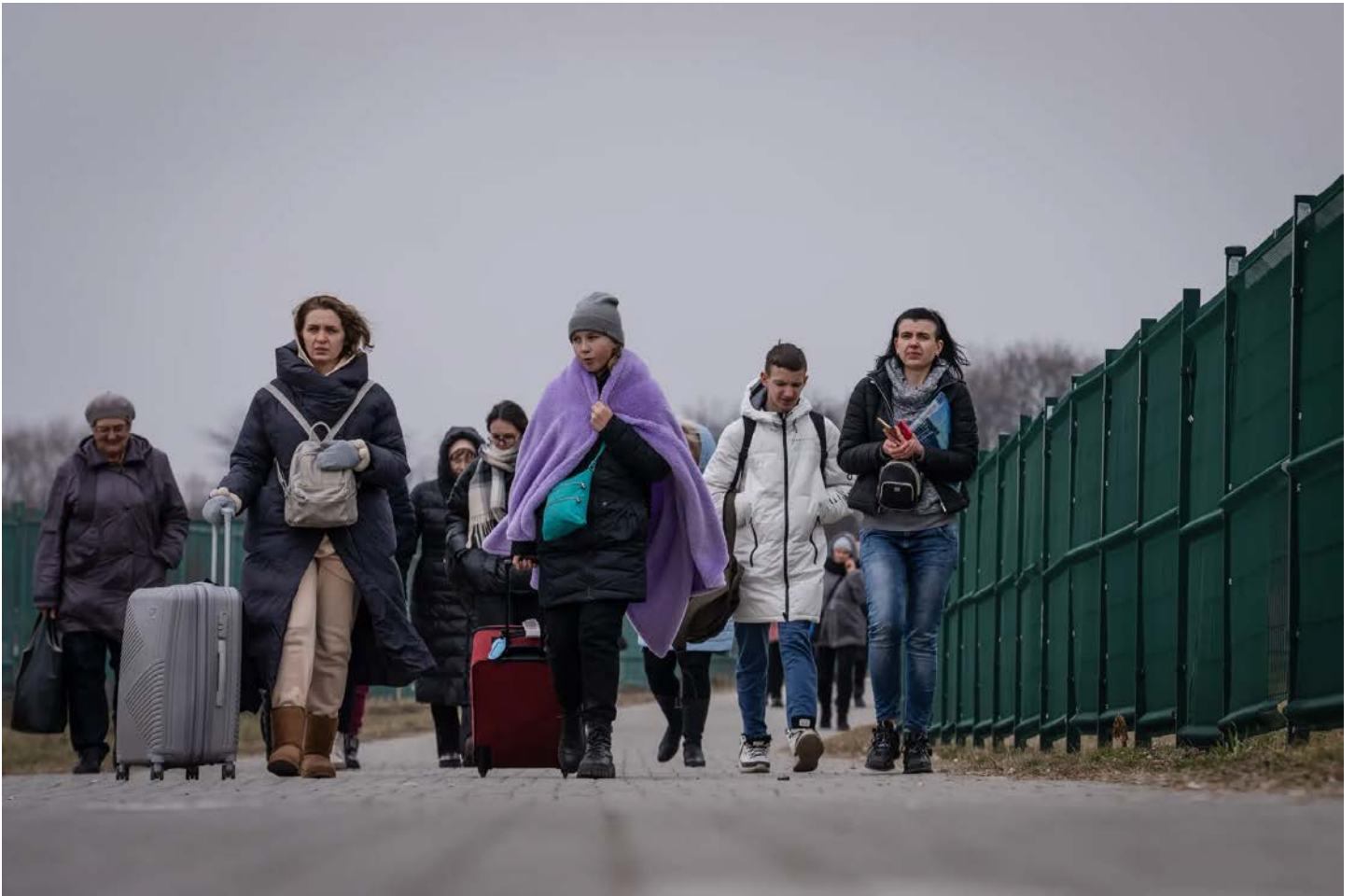
Refugees fleeing the war in Ukraine crossed into Poland on March 7.

The soldier then marched them to the forest and said: “Go Poland. If you come back, we will kill you.”