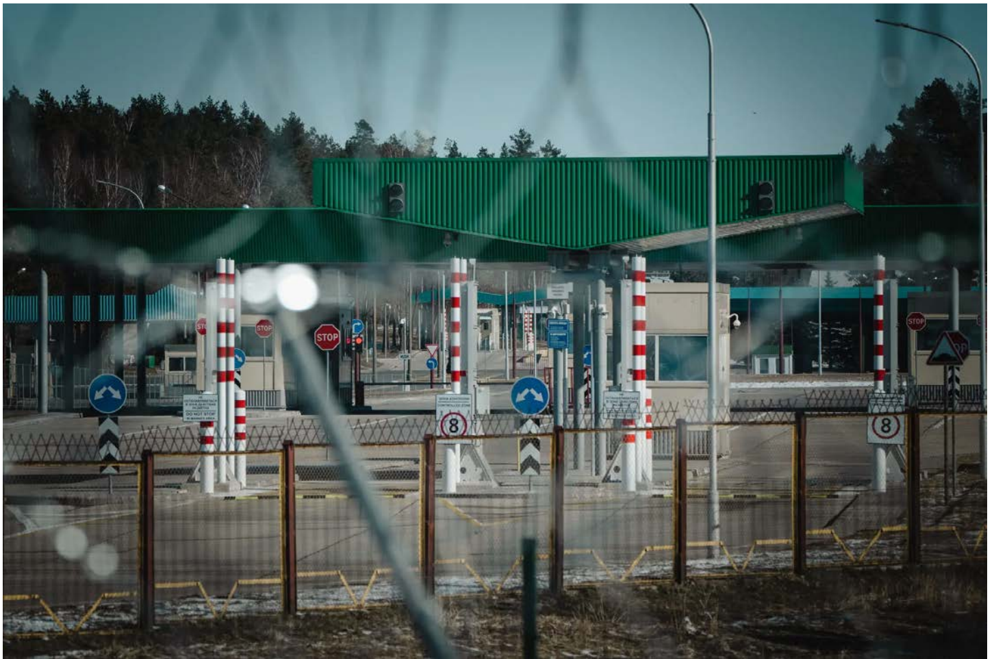
The closed Belarus border crossing seen from the Polish side of the border in Kuznica, Poland, on Thursday. This was the site of a manufactured crisis last year between Belarus and Poland in which tens of thousands of refugees were pushed from Belarus into Poland and then pushed back.