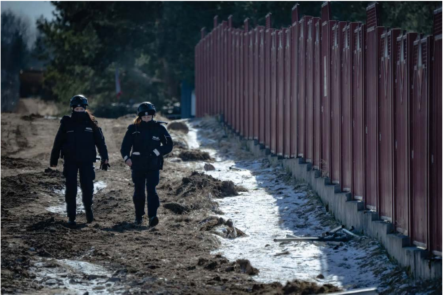
Polish police patrolling near the closed border with Belarus in Kuznica, Poland.